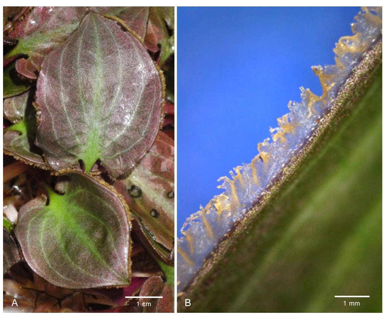
Fig. 4. Cryptocoryne aura – A: leaf showing surface patterns and transparent margin; B: close-up of transparent margin (the "aura") with ciliate trichomes.