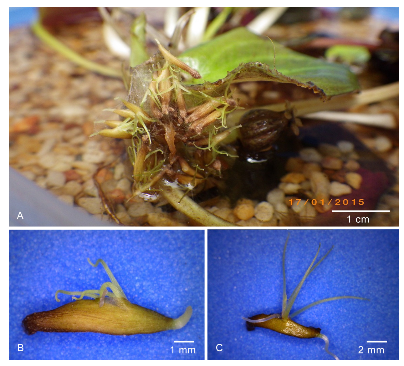
Fig. 6. Cryptocoryne aura – A: plant with opened syncarp with germinating seeds showing green plumulary processes; B: germinating seed showing first stage of primary root emerging from distal end of seed (right) and still curled-up plumulary processes emerging from testa; C: germinating seed at later stage than in A, showing long, bent primary root and 4 plumulary processes.

MacKinnon K., Hatta G., Halim H. & Mangalik A. 1996: The ecology of Indonesia series. Volume III: the ecology of Kalimantan. – Pp. 35–41 in: Chapter 1. The island of Borneo Flora. – Hong Kong: Periplus Editions.