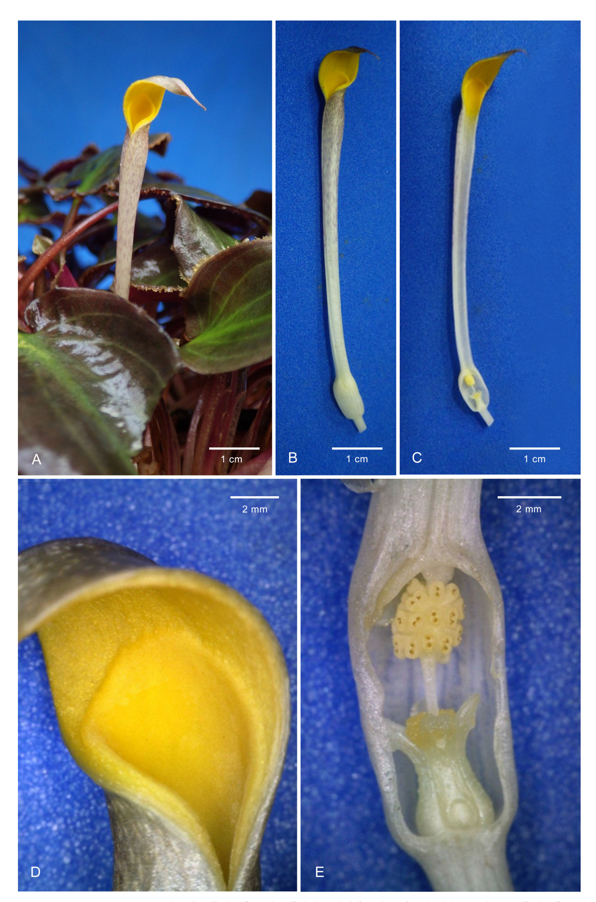
Fig. 5. Cryptocoryne aura – A: plant showing limb of spathe slightly subobliquely twisted (older spathe); B: limb of spathe bent forward at a younger stage than in A; C: spathe longitudinally cut open showing kettle in lower part; D: limb of spathe showing slightly raised collar; E: opened kettle showing female flowers below, olfactory bodies (yellow) above, sterile interstice, and male flowers above. – Photographs by S. Wongso.