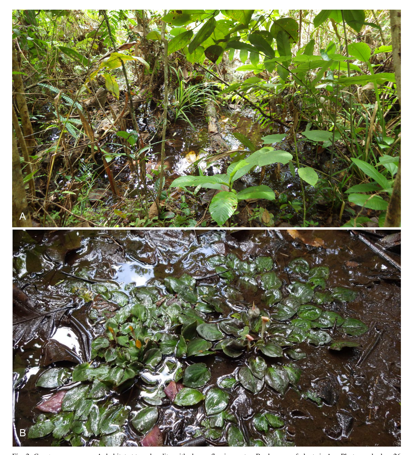
Fig. 2. Cryptocoryne aura – A: habitat at type locality with slower-flowing water; B: close-up of plants in A.

Etymology — The epithet alludes to the well-developed, slightly transparent, whitish membrane surrounding the leaf margin, which is likened to an aura.