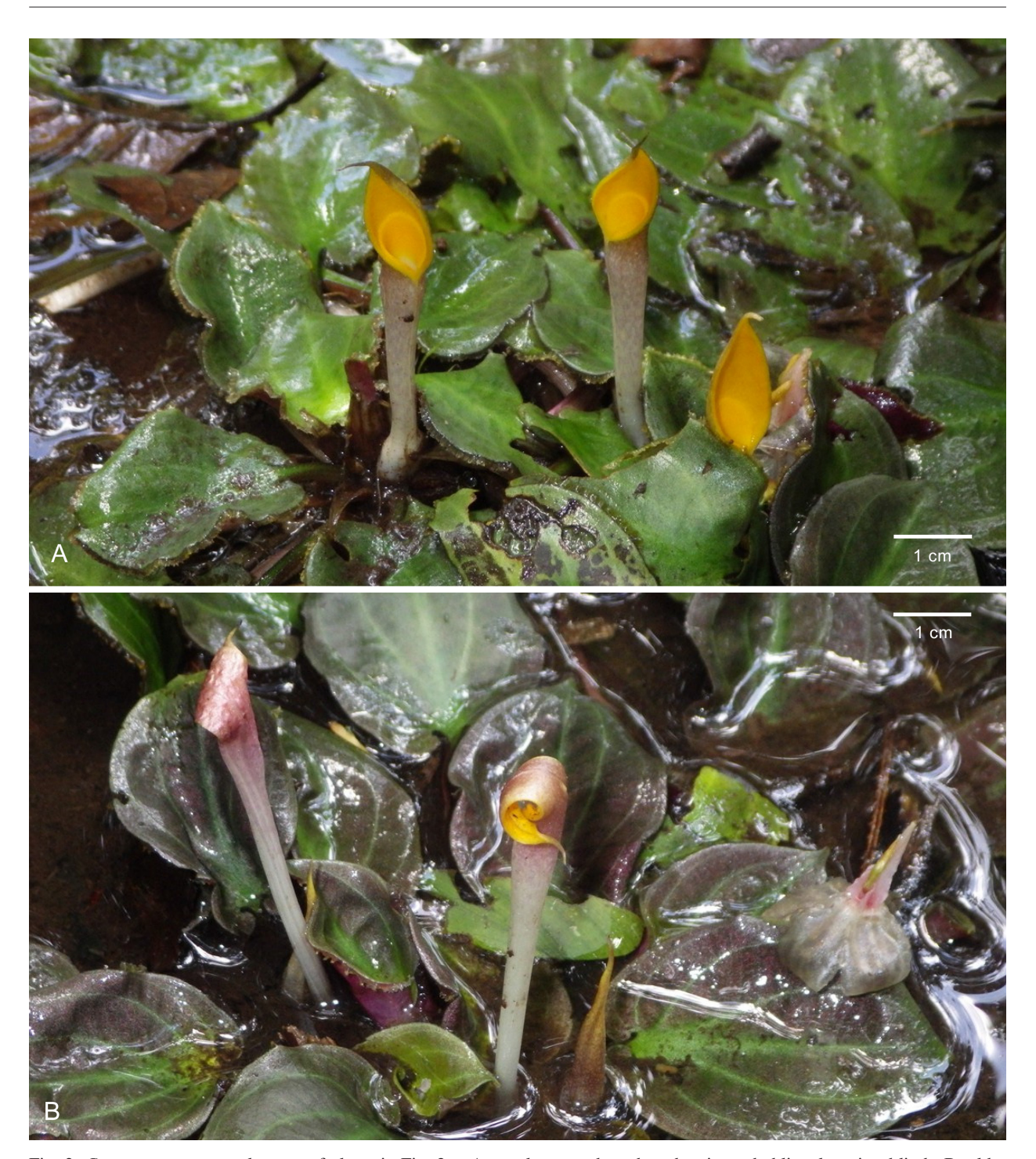
Fig. 3. Cryptocoryne aura , close-up of plants in Fig. 2. – A: newly opened spathes showing subobliquely twisted limb; B: older spathes showing forward-twisted limb. – Photographed on 26 February 2015 by S. Wongso.

Most species of Cryptocoryne have a rather undifferentiated embryo, which pushes through the distal end of the seed (micropylar end), and the root hairs can be seen at the "tip" of the embryo; just behind that, the plumulary processes (prophylls) are seen pointing "backwards". After further growth, more roots and leaves appear. Most of the embryo remains inside the seed, where it serves to absorb the endosperm in order to feed the growing embryo during the initial stages. There are a few exceptions to this simple embryo in